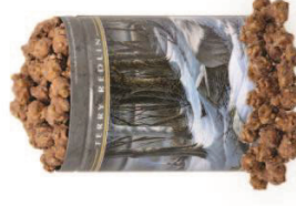
Boulder Ridge by Terry Redlin