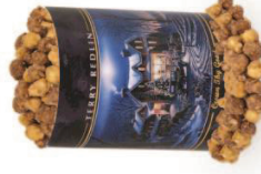
Crown Thy Good by Terry Redlin