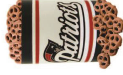
Official NFL New England Patriots