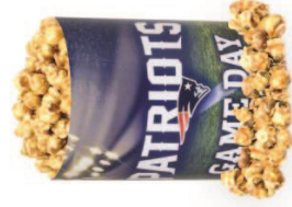
Official NFL New England Patriots