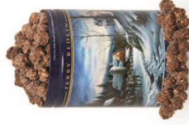
Coming Home by Terry Redlin